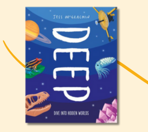
Deep by less McGeachin