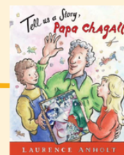
Tell Us A Story, Papa Chagall by Laurence Anholt