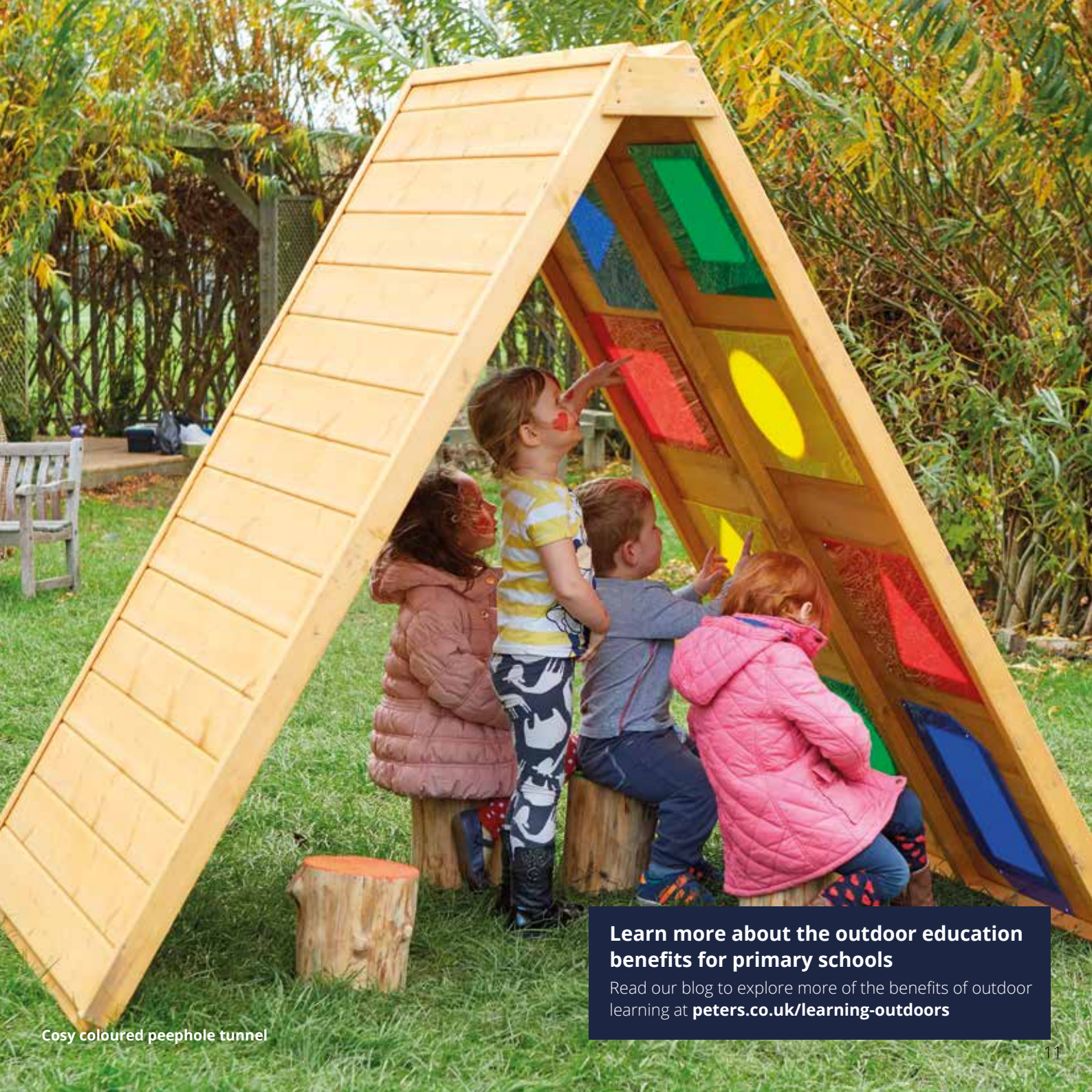
Cosy coloured peephole tunnel