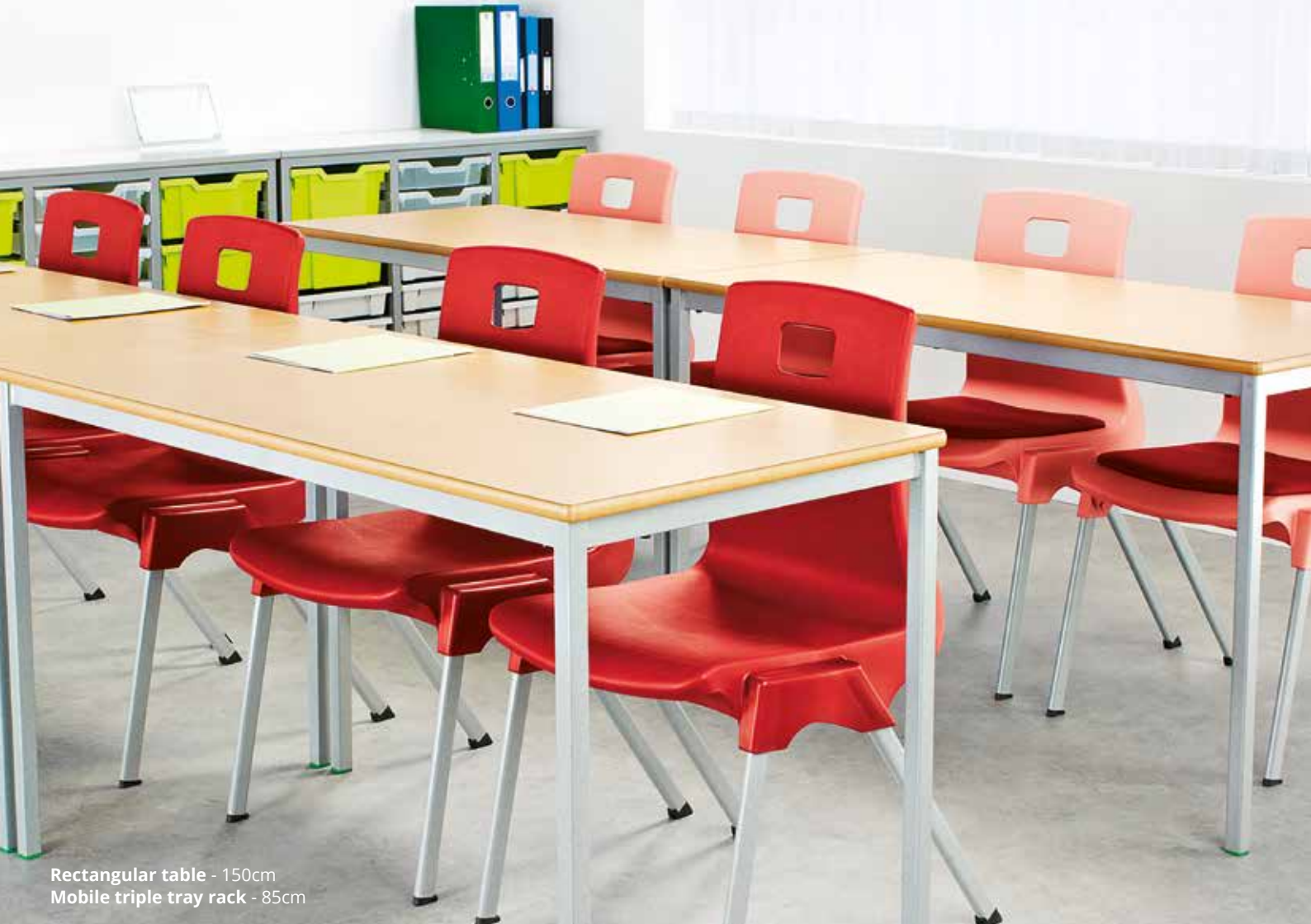
Rectangular table - 150cm Mobile triple tray rack - 85cm

The ideal classroom environment is functional and flexible, facilitating pupils' independent learning and group activities. Choose from a range of customisable tables and desks, seating, and other essential items to create an adaptable, inspiring space for teaching and learning.