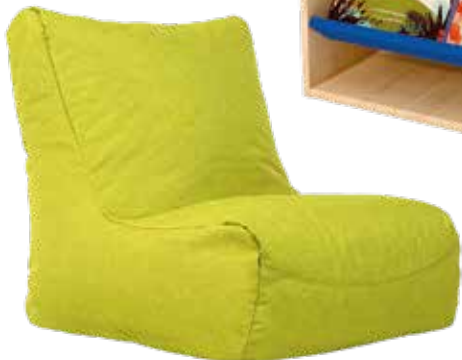
Primary smile beanbags (pack of 3)