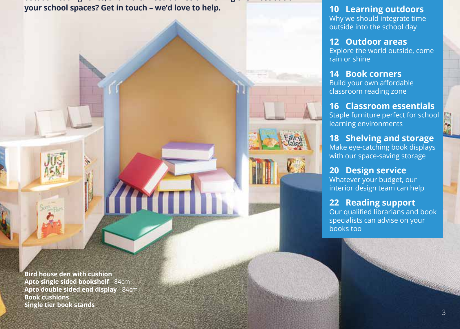
Bird house den with cushion Apto single sided bookshelf - 84cm Apto double sided end display - 84cm Book cushions Single tier book stands

Our interior design team are passionate about creating bespoke reading and learning spaces which excite children of all ages. We've packed this brochure full of inspiration for early years settings and Key Stage 1 and 2 classrooms, outdoor reading zones, and more. Need advice on making the most out of your school spaces? Get in touch - we'd love to help.