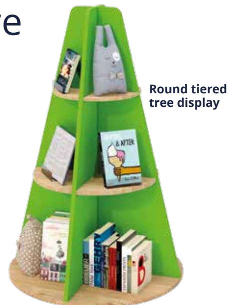
Round tiered tree display