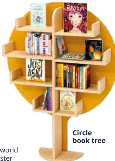
Circle book tree

Grow a reading forest in your classrooms, corridors or reception areas. Our uniquely shaped book trees are colour customisable and are delivered fully assembled. Pair a book tree with our nature-printed cushions and beanbags.