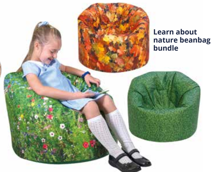
Learn about nature beanbag bundle

Find more nature-themed furniture and accessories online