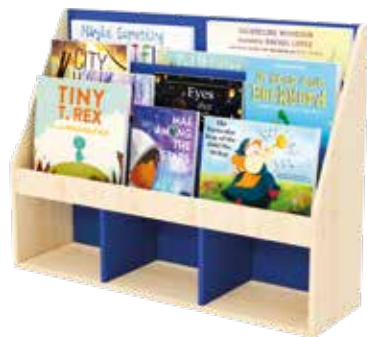
Single sided picture book display unit