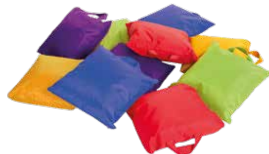
Grab & go cushions – bright

T: 0121 666 6646 E: furniture@peters.co.uk W: peters.co.uk/furniture