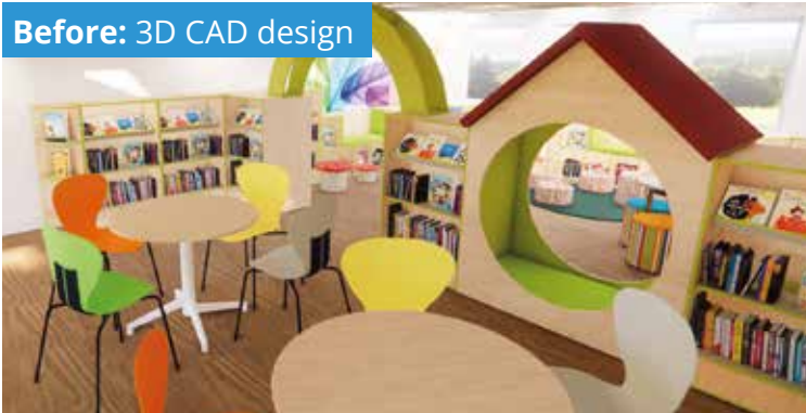
Before: 3D CAD design