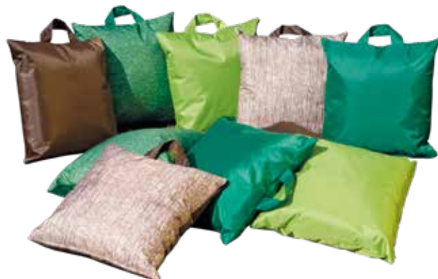
Grab & go cushions – nature