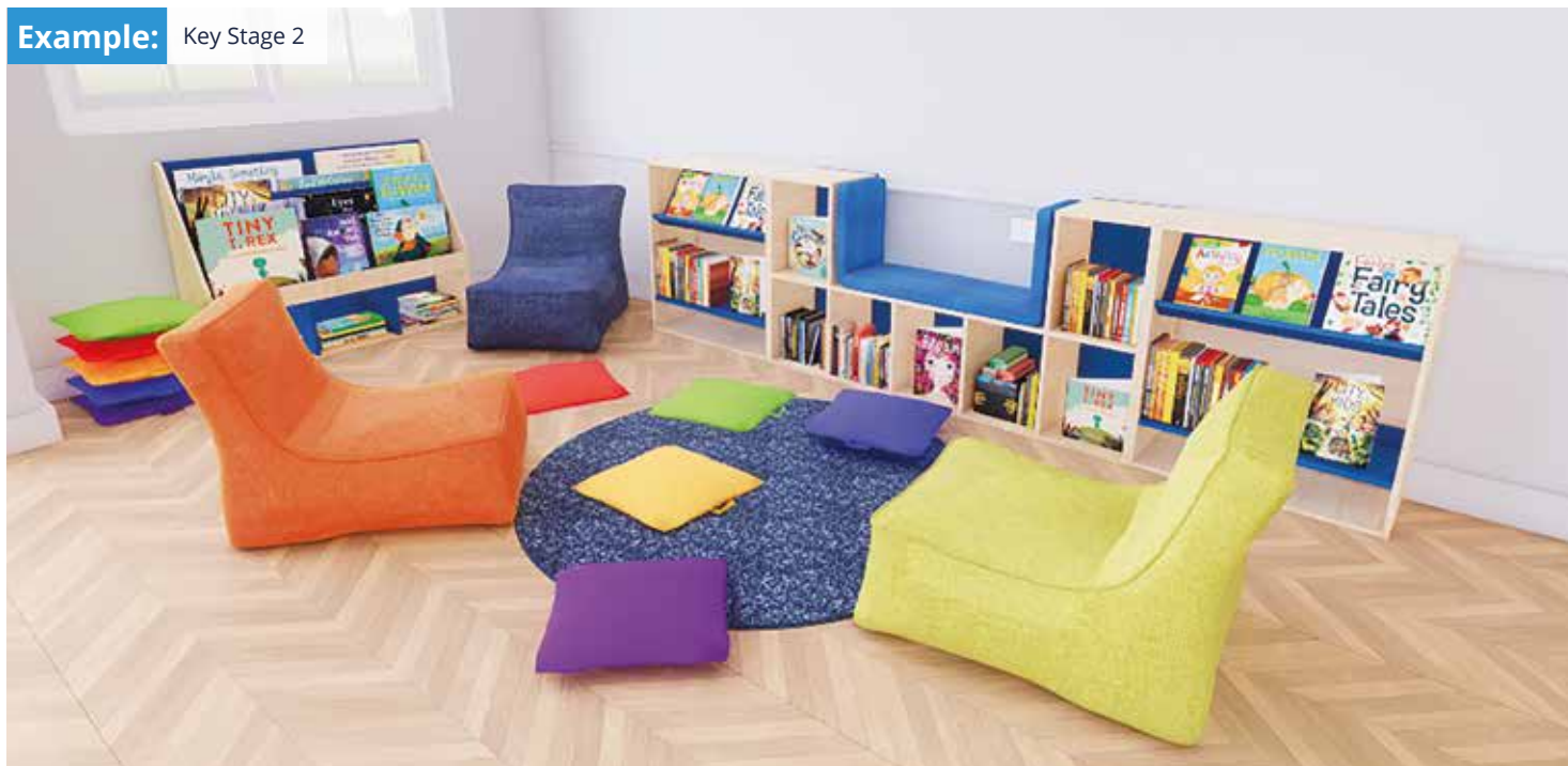
Apto single sided bookshelf - 84cm