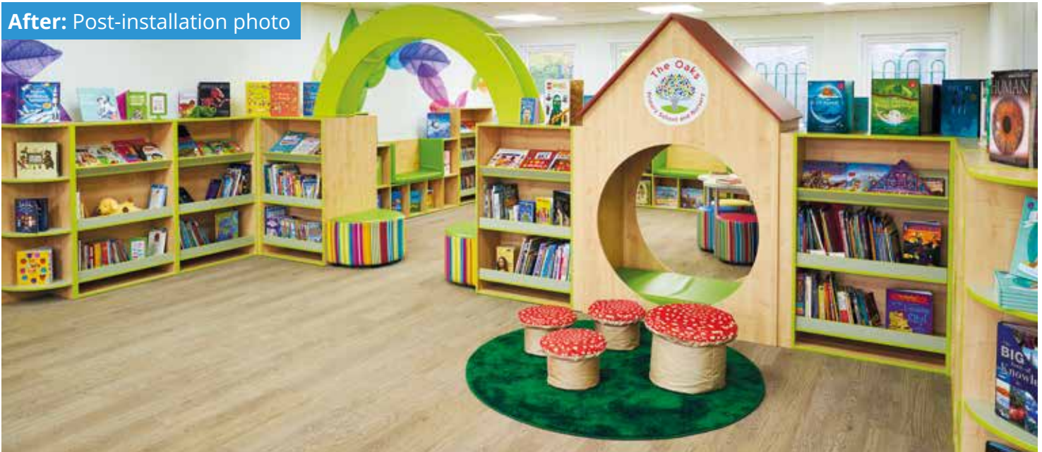
After: Post-installation photo

T: 0121 666 6646 E: furniture@peters.co.uk W: peters.co.uk/furniture