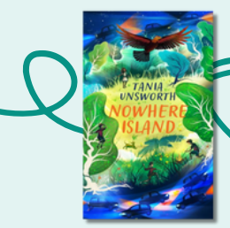
Nowhere Island by Tania Unsworth